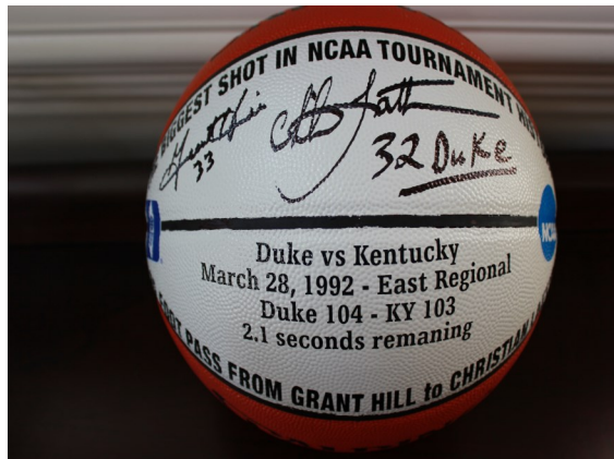
COMMEMORATIVE BASKETBALL CELEBRATING DUKE'S VICTORY VS. KENTUCKY IN THE '92 NCAA TOURNAMENT

A MUST-HAVE FOR ANY DUKE BASKETBALL FANATIC