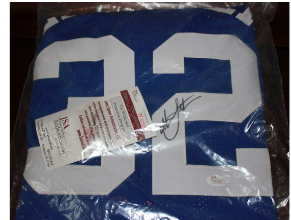
DUKE BASKETBALL JERSEY (XL) AUTOGRAPHED BY 2-TIME NCAA CHAMPION CHRISTIAN LAETTNER