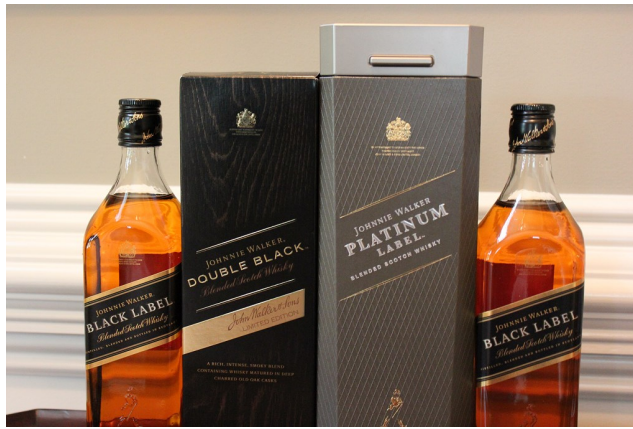
The Johnnie Walker collection