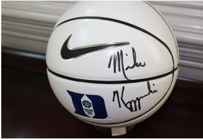
FULL SIZE BASKETBALL AUTO-GRAPHED BY DUKE COACH AND NATIONAL CHAMPION MIKE KRZYZEWSKI